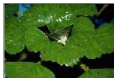
Close-up of flower