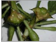
Close-up of Fruits