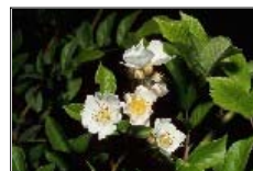
Close-up of flowers