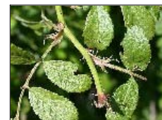
Close-up of fringed stipules