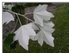
Lower leaf surface