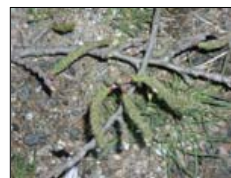
Close-up of inflorescences