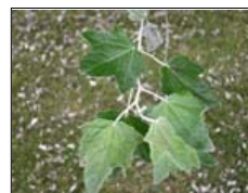
Upper leaf surface