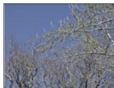
Branch with flowers