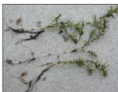
Whole plants out of water