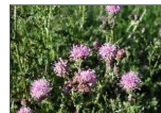
Close-up of flowers