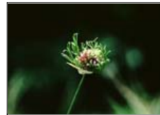
Vegetative propagule inflorescence